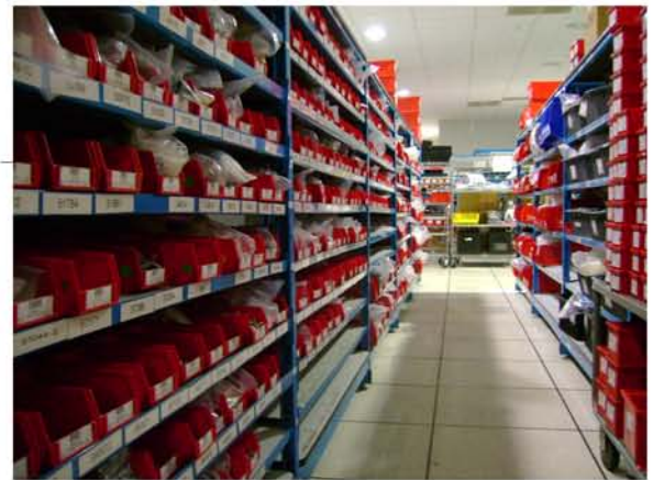
BIN STOCKING PROGRAMS AVAILABLE

Northwest Service Center 31012 Huntwood Avenue Hayward, CA 94544 (510) 487-2100 Toll Free: (800) 824-5449 Fax: (510) 471-7018 Email: sales@acfcom.com